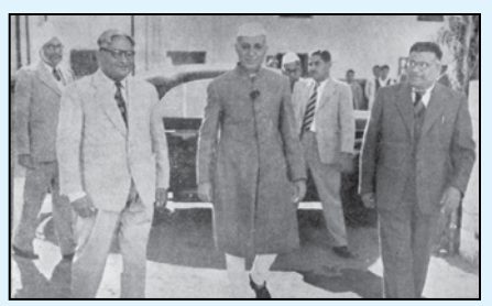
The then Prime Minister of India, Late Pandit Jawahar Lal Nehru arriving to inaugurate the Silver Jubilee Session of the CBIP in 1952